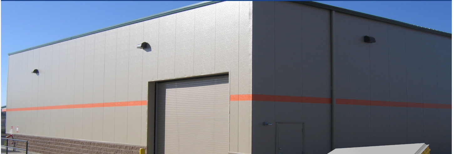
Image shown is a representation of HE42-MW not the actual profile